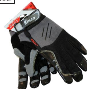
Unlined Handler Gloves MiraX2™ Synthetic Leather Palm covered with Silicone Grip Sewn with Kevalr Thread Sizes: SM, MD, L, XL 2XL V6K-2021