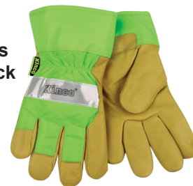
Pigskin Palm & Fingers Hi-Viz Lime Canvas Back with Safety Cuff Thinsulate Lining Size: Large V6K-1939