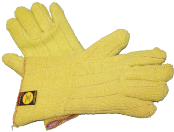
KEVLAR® TERRY Knit Glove with Wool Lining Domestic - One-Size V6A-742WL