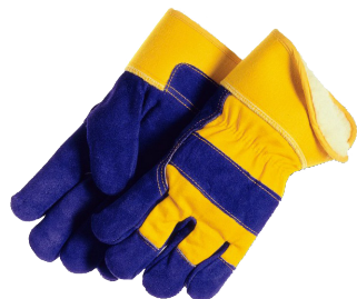
Blue Leather Palm & Fingers, Yellow Canvas Back & Safety Cuff Sherpa Pile Lining Sizes: Medium thru 2XLarge V6E-1600