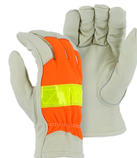
Grain Leather Driver Style with Fluorescent Orange Back with Yellow Reflective Stripe Thinsulate Lined Sizes: Medium thru 2XLarge V6E-1951