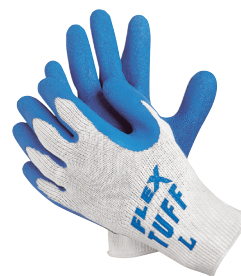
Flex Tuff® Gloves Cotton/Polyester Knit with Latex Dipped Palm Sizes: S, M, L, XL V6D-9680