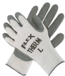
Flex Therm™ Latex Palm & Fingertips Dipped 10 Gauge, Extra Thermal Protection Sizes: Medium, Large, XLarge V6D-9690-(size)