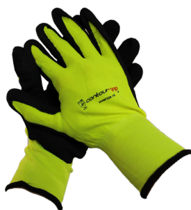
Hi-Viz Contour Grip Gloves HV Lime Nylon Shell with Black Nitrile Coated Palm Sizes: Sm (7), Md (8), Lg (9), XL (10), 2XL (11) VSG-HVNF338