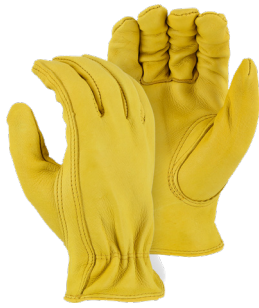
Grade-B Deerskin Unlined Sizes: Medium, Large & XLarge V6E-1541B