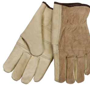
Grain Leather with Split Back Unlined Sizes: Small, Medium, Large & XLarge V6D-32055