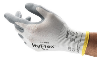
Ansell HyFlex® Gloves with Nitrile Foam Coated Palm Sizes: 7, 8, 9, 10, 11 V5N-ANE-11-800-size