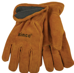
Split Cowhide Driver Style Black Fleece Lining Sizes: Large & XLarge V6K-50RL