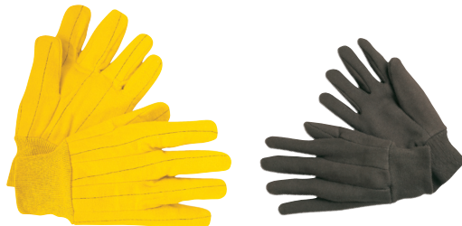
Import CHORE Work Gloves