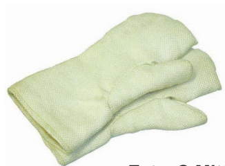
Zetex® Mitts 14" with Wool Lining V7P-174ZWL

Kevlar® and Nomex® are registered trademarks of E.I. DuPont DeNemours & Co. Zetex® is a registered trademark of Newtex Industries. Velcro® is a registered trademark of Velcro USA Companies Inc.