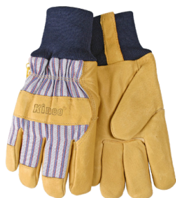
Grain Pigskin Palm & Fingers, Striped Canvas Back & Knit Wrist Heat Keep Lining Size: Large V6K-1927KW