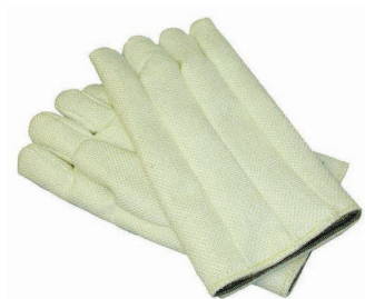
Zetex® Gloves 14" with Wool Lining V7P-234ZWL