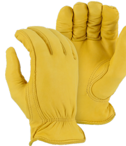
Deerskin Driver Style Thinsulate Lined Sizes: Medium thru Xlarge V6E-1542T