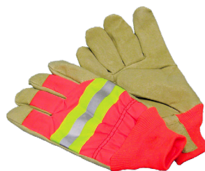
Pigskin Palm & Fingers Fluorescent Orange Back with 3M Reflective Stripe, Knit Wrist Thermosock Lining Size: Large V6D-3440L