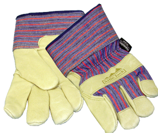
Artic Jack Pigskin Palm & Fingers, Blue/Red Striped Canvas Back, Safety Cuff Thinsulate Lining Size: Large & XLarge V6D-1965L