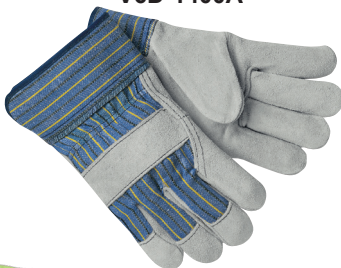
Leather Palm & Fingers, Canvas Back & Safety Cuff Sizes: Small and Large V6D-1400A