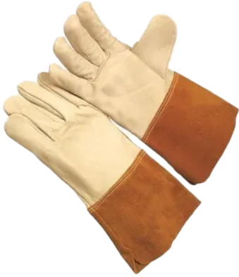
Mig/Tig Welding Gloves Premium Grain Cowhide Leather with 4.5" Split Leather Gauntlet Cuff Kevlar Sewn Sizes: Small to 2XLarge VSG-5420LCK-sz