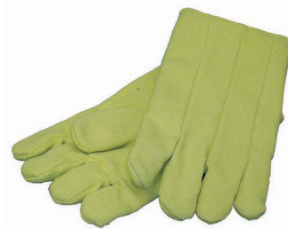
Kevlar® Gloves 14" with Wool Lining V7P-234KVWL