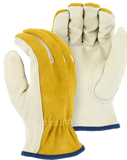
Grain Leather Driver Style with Split Leather Back & Red Fleece Lining Sizes: Medium thru 2XLarge V6E-1535