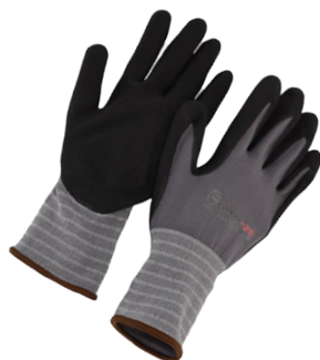
Contour Grip Gloves Nylon Shell with Nitrile Coated Palm Sizes: 7, 8, 9, 10, 11 VSG-NMF506 - with MicroFoam VSG-NMFD608 - with Micro-Dots