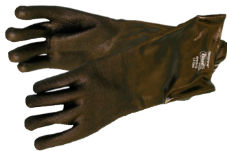
Best® Neo Grab™ Neoprene Coated Gloves