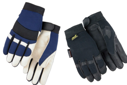
Insulated Mechanic's Gloves Pigskin Palm & Fingers with Thinsulate Lining Deerskin Palm & Fingers with "Heatlok" Lining Size: Medium thru XLarge V6E-2152T - Pigskin (Blue) V6E-2151H - Deerskin (Black)