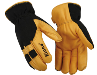
Deerskin Driver Style with Spandex Back & Thermal Sock Lining Sizes: Medium, Large & XLarge V6K-101HK