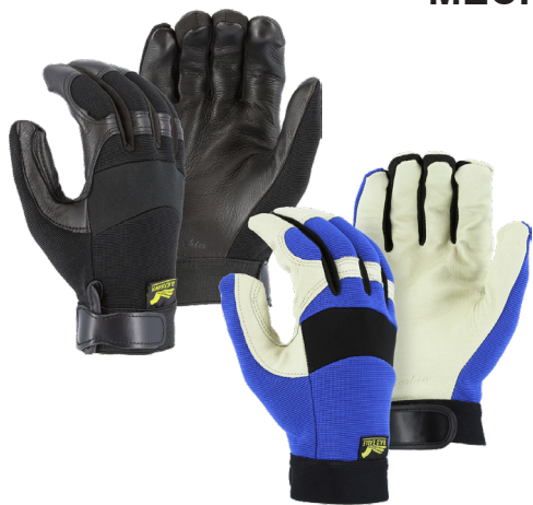
MECHANIC'S Style Work Gloves with Stretch Back & Velcro Wrist Closure