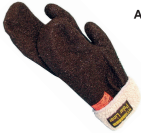
Polar Mitts with Acrylic Pile Insulated Lining Sizes: (1)Large, (2)XLarge V6F-GL