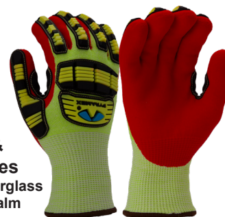
Cut Resistant & Anti-Impact Gloves 13 Ga HPPE Shell w/Fiberglass Sandy Foam Nitrile Palm TPR Overlays ANSI Cut Level A6 Puncture Level 4 Sizes: M, L, XL, 2X V5G-GL612C-size