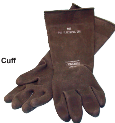
Natural Rubber Latex HD™ 18" Unlined Black Smooth Finish & Rolled Cuff (50 mil thickness) sizes: 9 & 10 V6B-558

NOTE: Above Gloves are NOT for Electrical Use