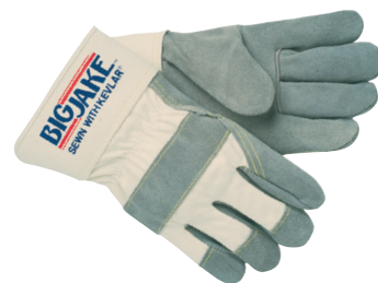
Big Jake™ Leather Palm & Fingers, Canvas Back & Safety Cuff Sewn with Kevlar Thread Sizes: Large and XLarge V6D-1700