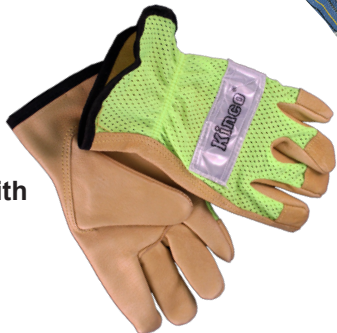
Leather Palm & Fingers, Lime/Yellow Mesh Back with 3M® Reflective Knuckle Size: Large V6K-908