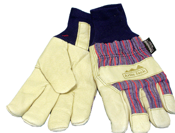
Artic Jack Pigskin Palm & Fingers, Blue/Red Striped Canvas Back, Knit Wrist Thinsulate Lined Size: Large & XLarge V6D-1956