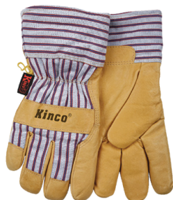
Grain Pigskin Palm & Fingers, Striped Canvas Back & Safety Cuff Heat Keep Lining Sizes: Medium thru 2XLarge V6K-1927