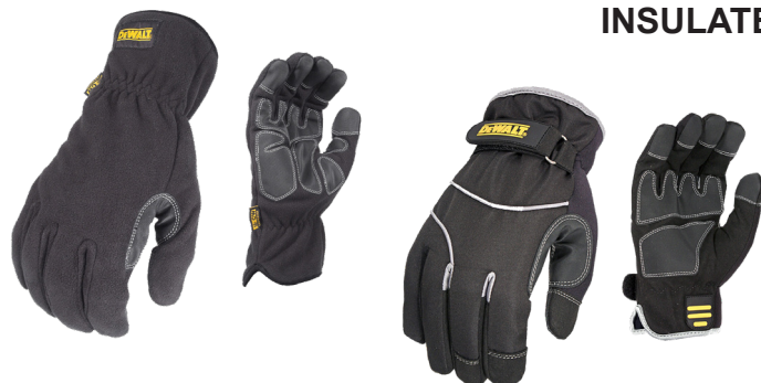
Cold Weather MECHANIC'S Style Work Gloves