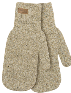
Ragg Wool Mitten with Elastic Knit Wrist Acrylic/Wool Blend V6K-5230-L V6K-5230-XL