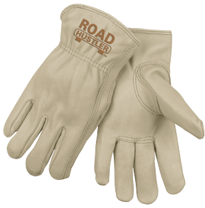
Premium Grain Leather Unlined Sizes: Small, Medium, Large & XLarge V6D-3200