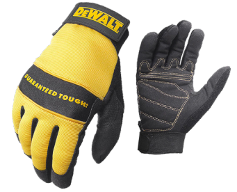
All Purpose Utility Padded Palm & Knuckle Sizes: Medium, Large & XLarge V7LR-DPG20