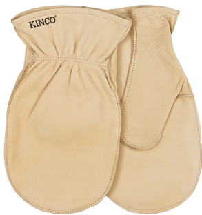
Choppers Cowhide Leather V6K-1931-L V6K-1931-XL