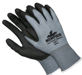
Ultra-Tech® HPT Gloves Nylon Shell with HPT Coated Palm Sizes: S, M, L, XL, XXL V6D-9699