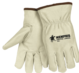
Premium Grain Pigskin Driver Style Thermosock Lined Sizes: Small thru XLarge V6D-3460