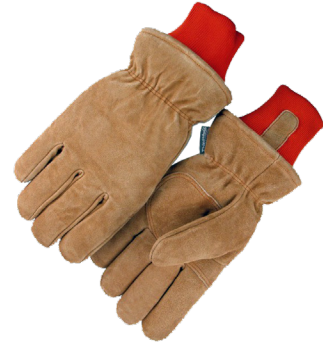
Split Leather Freezer Glove with Knit Wrist Thinsulate Lining Size: XLarge V6E-1640