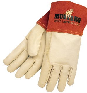
Mustang™ Mig/Tig Welder's Gloves with Kevlar Thread and 4½" Gauntlet Cuff Sizes: Medium to XLarge V6D-4950