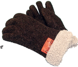
Polar Gloves with Acrylic Pile Insulated Lining Size: XLarge V6F-EF2