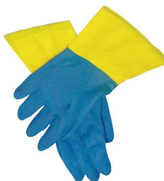
Neoprene/Rubber Blend Flock-lined Blue/Yellow with Diamond Grip (28 mil) Sizes: 9, 10, 11 VSG-LN28