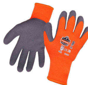
ProFlex 7401 Coated Lightweight Winter Work Glove Foam Latex Coated Palm 10g Acrylic Fleece Liner Sizes: 3(M), 4(L), 5(XL), 6(2XL) V5E-1789#(size)