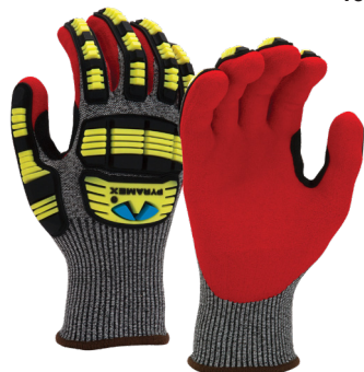
Cut Resistant & Anti-Impact Gloves 13 Ga HPPE Shell w/Fiberglass Sandy Foam Nitrile Palm TPR Overlays ANSI Cut Level A6 Puncture Level 4 Sizes: M, L, XL, 2X V5G-GL609C-size