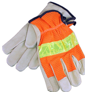
Pigskin Palm & Fingers, Orange Mesh Back with Reflective Knuckle Size: Large & XLarge V6D-34111