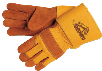
Bronco® Leather Palm & Fingers, Yellow Canvas Back & 4½" Gauntlet Cuff Size: Large V6D-1690