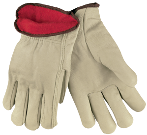
Grain Leather Driver Style with Fleece Lining Sizes: Small, Medium, Large & XLarge V6D-3250