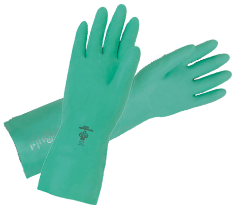
Green Nitrile Gloves with Embossed Grip