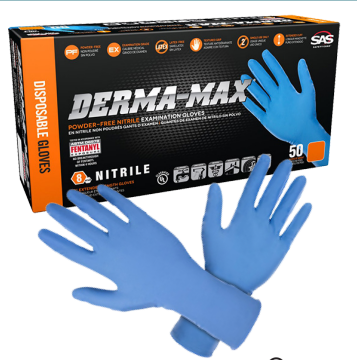
DERMA-MAX® Disposable NitrileGloves 8 Mil Powder Free