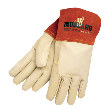
Mustang™ Mig/Tig Welder's Gloves with Kevlar Thread and 4½" Gauntlet Cuff V6D-4950