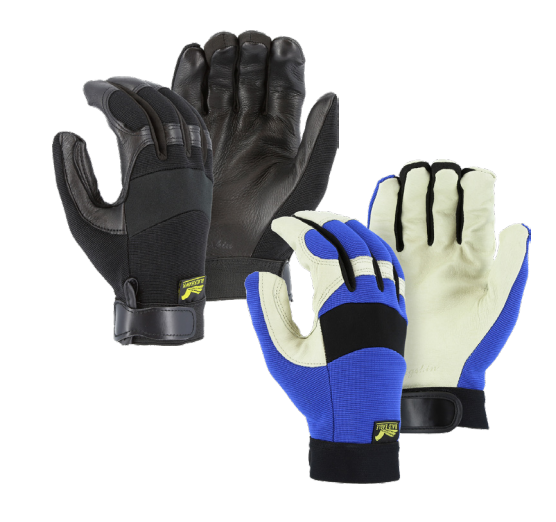
MECHANIC'S Style Work Gloves with Stretch Back & Velcro Wrist Closure