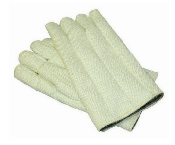
Zetex® Gloves 14" with Wool Lining V7P-234ZWL