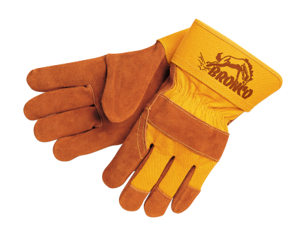
Bronco® Leather Palm & Fingers, Yellow Canvas Back & 2½" Safety Cuff Size: Large V6D-1680