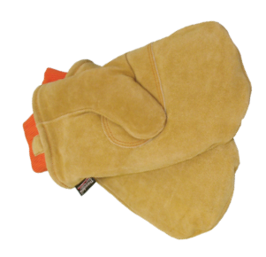
Split Leather Freezer Mitts with Knit Wrist Thinsulate Lining Size: XLarge V6E-1636