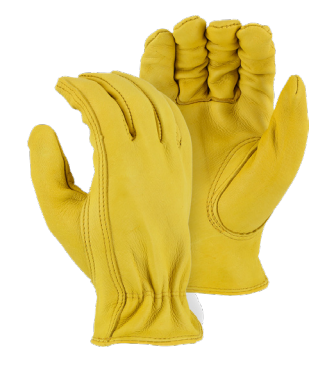
Grade-B Deerskin Unlined Sizes: Medium, Large & XLarge V6E-1541B