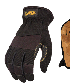
Performance Driver Hybrid Premium Grade Cowhide Reinforced Thumb Saddle Sizes: Medium, Large & XLarge V7LR-DPG212