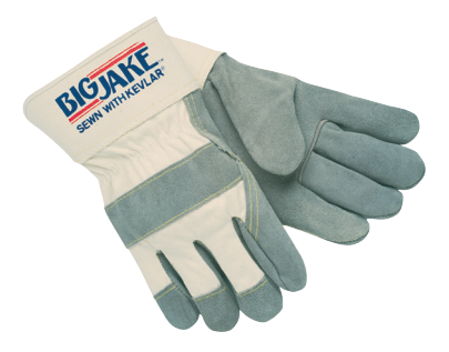
Big Jake™ Leather Palm & Fingers, Canvas Back & Safety Cuff Sewn with Kevlar Thread Sizes: Large and XLarge V6D-1700