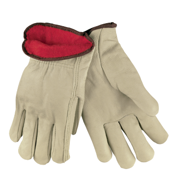
Grain Leather Driver Style with Fleece Lining Sizes: Small, Medium, Large & XLarge V6D-3250