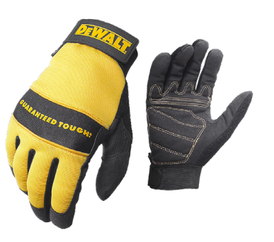
All Purpose Utility Padded Palm & Knuckle Sizes: Medium, Large & XLarge V7LR-DPG20