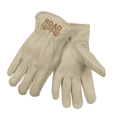
Premium Grain Leather Unlined Sizes: Small, Medium, Large & XLarge V6D-3200