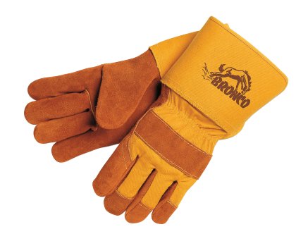
Bronco® Leather Palm & Fingers, Yellow Canvas Back & 41/2" Gauntlet Cuff Size: Large V6D-1690