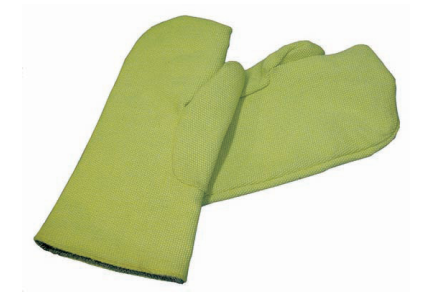
Kevlar® Mitts 14" with Wool Lining V7P-174KVWL