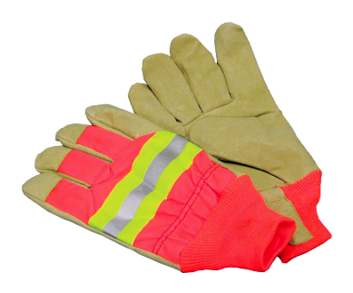
Pigskin Palm and Fingers Fluorescent Orange Back with 3M Reflective Stripe, Knit Wrist Thermosock Lining Size: Large V6D-3440L