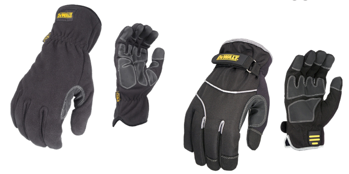
Cold Weather MECHANIC'S Style Work Gloves