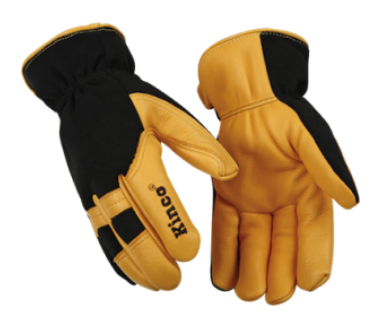
Deerskin Driver Style with Spandex Back & Thermal Sock Lining Sizes: Medium, Large & XLarge V6K-101HK