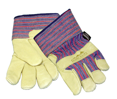
Artic Jack Pigskin Palm & Fingers, Blue/Red Striped Canvas Back, Safety Cuff Thinsulate Lining Size: Large V6D-1965L