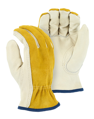
Grain Leather Driver Style with Split Leather Back & Red Fleece Lining Sizes: Medium thru 2XLarge V6E-1535