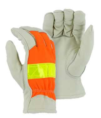
Grain Leather Driver Style with Fluorescent Orange Back with Yellow Reflective Stripe Thinsulate Lined Sizes: Medium thru 2XLarge V6E-1951