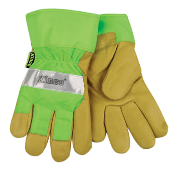
Pigskin Palm & Fingers Hi-Viz Lime Canvas Back with Safety Cuff Thinsulate Lining Size: Large V6K-1939