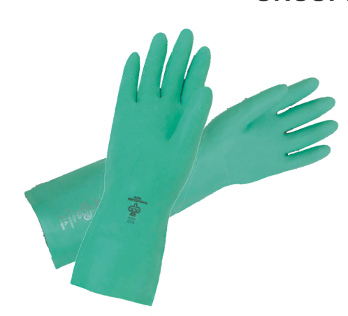
Green Nitrile Gloves with Embossed Grip