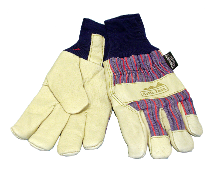
Artic Jack Pigskin Palm & Fingers, Blue/Red Striped Canvas Back, Knit Wrist Thinsulate Lined Size: Large V6D-