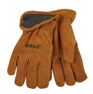
Split Cowhide Driver Style Black Fleece Lining Sizes: Large & XLarge V6K-50RL