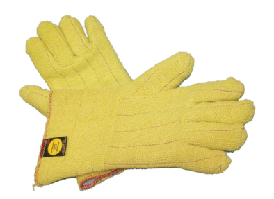
KEVLAR® TERRY Knit Glove with Wool Lining Domestic - One-Size V6A-742WL