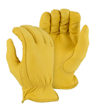
Deerskin Driver Style Thinsulate Lined Sizes: Medium thru Xlarge V6E-1542T