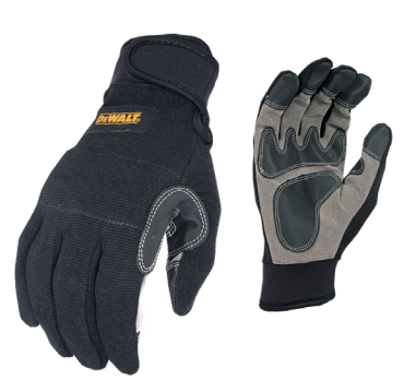
SecureFit™ General Utility Glove Foam Padded Knuckle Rubberized Overlays SecureFit™ Wrist Closure Sizes: MD, L, XL V7LR-DPG217