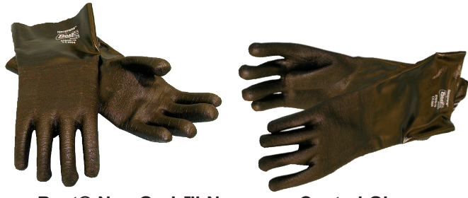
Best® Neo Grab™ Neoprene Coated Gloves