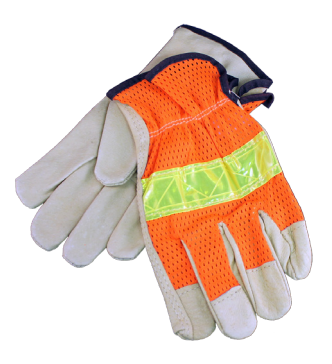
Pigskin Palm & Fingers, Orange Mesh Back with Reflective Knuckle Size: Large & XLarge V6D-34111