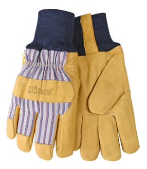
Grain Pigskin Leather Palm & Fingers, Striped Canvas Back & Knit Wrist Heat Keep Lining Size: Large V6K-1927KW