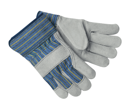
Leather Palm & Fingers, Canvas Back & Safety Cuff Sizes: Small and Large V6D-1400A