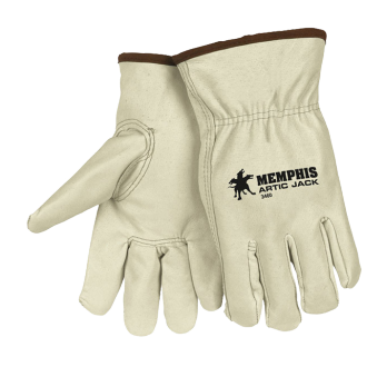
Premium Grain Pigskin Driver Style Thermosock Lined Sizes: Small thru Xlarge V6D-3460