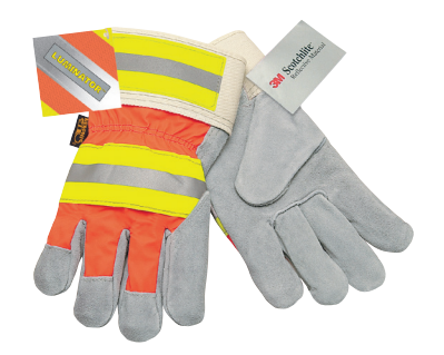
Leather Palm & Fingers, Orange/Yellow Nylon Back with 3M® Reflective Tape & 2½" Canvas Safety Cuff Size: Large V6D-1440L