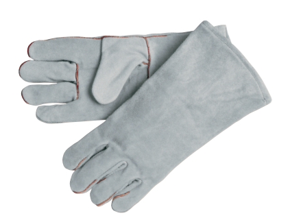
Economy Welder's Gloves 13" Gray Leather with Wing Thumb V6D-4150