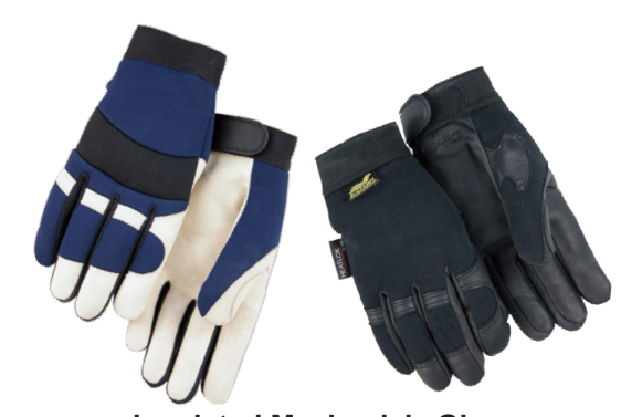
Insulated Mechanic's Gloves Pigskin Palm & Fingers with Thinsulate Lining Deerskin Palm & Fingers with "Heatlok" Lining Size: Medium thru XLarge V6E-2152T - Pigskin (Blue) V6E-2151H - Deerskin (Black)