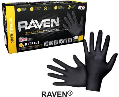
Black Nitrile Examination Gloves 7 mil Powder Free