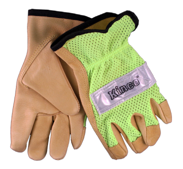
Leather Palm & Fingers, Lime/Yellow Mesh Back with 3M® Reflective Knuckle Size: Large V6K-908