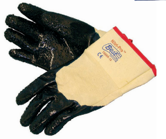
Best® Nitri Pro™ Nitrile Coated Gloves