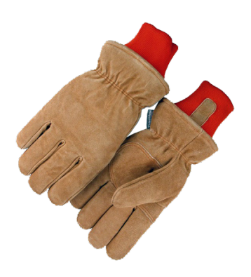
Split Leather Freezer Glove with Knit Wrist Thinsulate Lining Size: XLarge V6E-1640