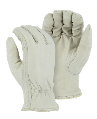
Cowhide Driver Style Pile Lined Sizes: Large & Xlarge V6E-1511