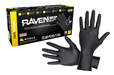
RAVEN® GRIP Extended Cuff Black Nitrile Examination Gloves 8 mil Powder Free