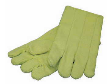
Kevlar® Gloves 14" with Wool Lining V7P-234KVWL