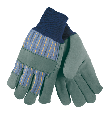
Leather Palm & Fingers, Canvas Back & Knit Wrist Sizes: Small (Ladie's) and Large V6D-1420A