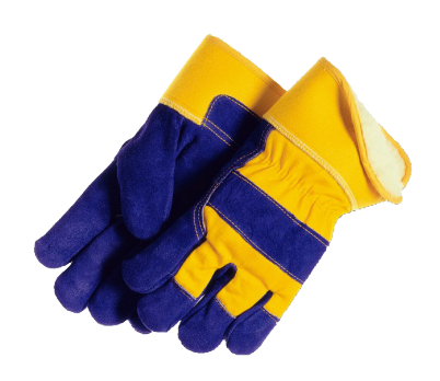
Blue Leather Palm & Fingers, Yellow Canvas Back & Safety Cuff Sherpa Pile Lining Sizes: Medium thru 2XLarge V6E-1600