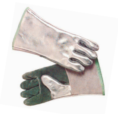
Aluminized Leather Gloves 14" with Wool Lining V7P-901ALUM

Kevlar® and Nomex® are registered trademarks of E.I. DuPont DeNemours & Co. Zetex® is a registered trademark of Newtex Industries. Velcro® is a registered trademark of Velcro USA Companies Inc.