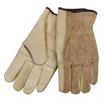
Grain Leather with Split Back Unlined Sizes: Small, Medium, Large & XLarge V6D-32055