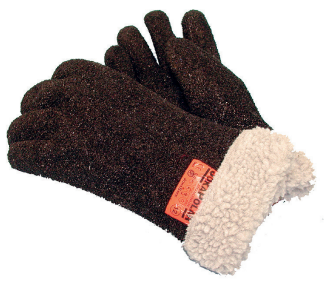
Polar Gloves with Acrylic Pile Insulated Liner Size: XLarge V6F-EF2