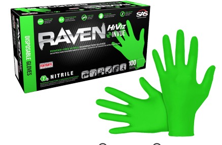
RAVEN® INVUE® HiViz Nitrile ExaminationGloves 7 mil Powder Free