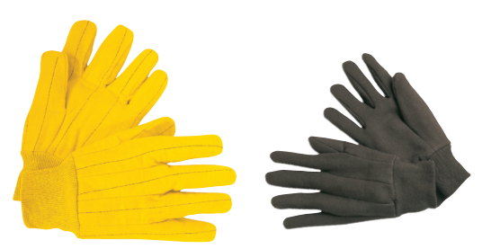
Import CHORE Work Gloves