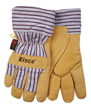
Grain Pigskin Leather Palm & Fingers, Striped Canvas Back & Safety Cuff Heat Keep Lining Sizes: Medium thru 2XLarge V6K-1927