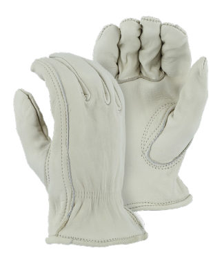
A-Grade Grain Leather Unlined Sizes: 10, 11, 12 V6E-1510